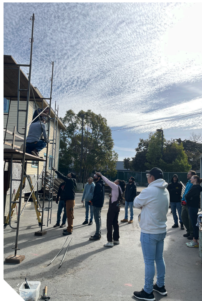
CityBuild participants observe scaffolding demonstration

Given CityBuild’s close relationship to San Francisco’s local hiring mandates, it makes sense to judge CityBuild, at least in part, by the city’s ability to meet the requirements of this ordinance. OEWD releases an annual report listing projects covered by the local hiring law along with the percentage of work hours and apprentice hours that local residents completed. 48 City residents completed 34% of all construction hours and 51% of apprentice work hours in 2022. Both numbers exceeded statutory mandates. The report also breaks down the project hours worked by race. A majority of San Francisco residents who worked on covered projects in the past year were people of color, with Hispanic residents accounting for about 42% of all local workers.