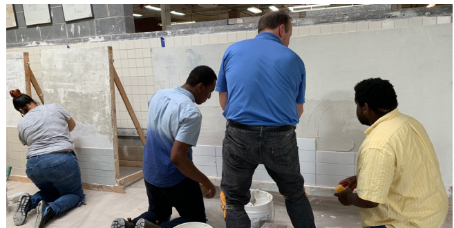
ARC affiliate participants